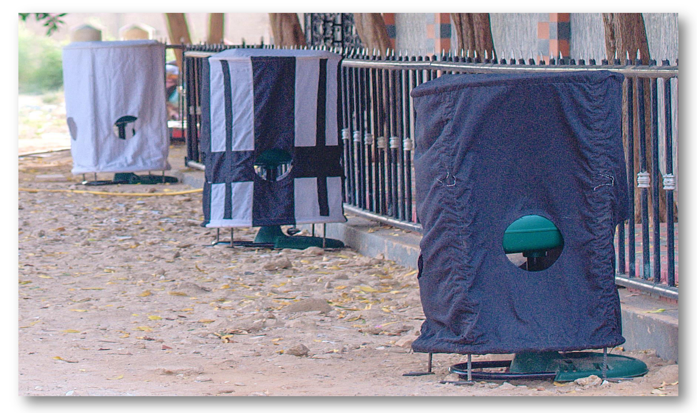
Fig. 2 Experimental setup: MM traps with covers of black, contrasted and white fabric, mosquitoes pass the textile covers from below and the holes in the side, and get sucked into the trap.

while paired student t-tests were used to check for significance between the differently coloured targets. Analysis was conducted using GraphPad Prism 9.00 for windows (GraphPad Software, La Jolla California, USA). Significance was taken at p<0.05.