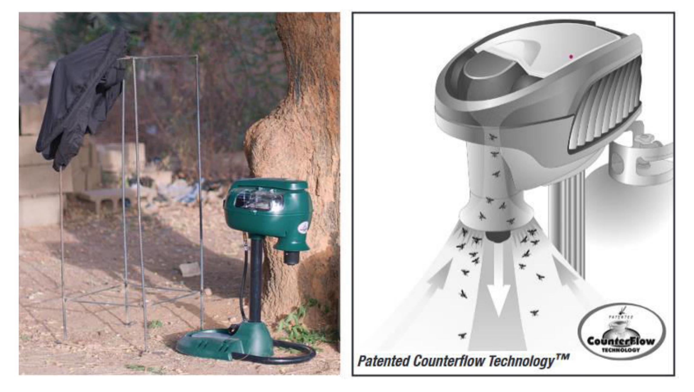
Fig.1 Metal frame with fabric cover (left) and the Mosquito Magnet Liberty Plus (right). The trap is combusting propane and releases CO_2 , the strongest universal attractant for mosquitoes (1).

Objectives: To assess the influence of black, white, and black/ white contrasted clothing on the rates of attraction exhibited by different species of vector mosquitoes under both diurnal and nocturnal conditions.